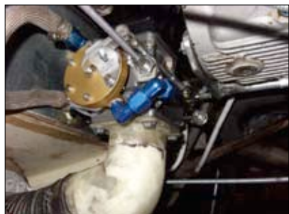
A Subaru installation of the Rotec TBI.

Because the Rotec TBI does not have an accelerator pump, the engine must be primed before cold starts by locally manufacturing and installing a linkage to