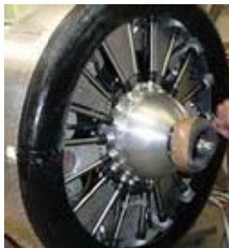
Baffles between cylinders

* Baffles are secured between each of the cylinders such that the air is diverted through the cooling fins of the cylinders. Though this increases the resistance in flight, it achieves cooling by channelling the bulk of air to flow through/across the fins.