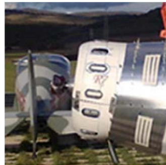
Vents (4off) being installed