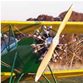
Fully Exposed Engine

In the following examples: The first pic shows a fully exposed engine; second: a cowled engine with a flow through gap between the rear of the cowl and fuse (gap =1.5"); third: Vents being installed with a total of 4 with 2 more on the opposite side of the cowl; fourth: note the scoop at the bottom of the cowl allowing air to flow through and vent outward.