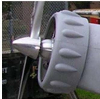
Gap between fuse & Cowl